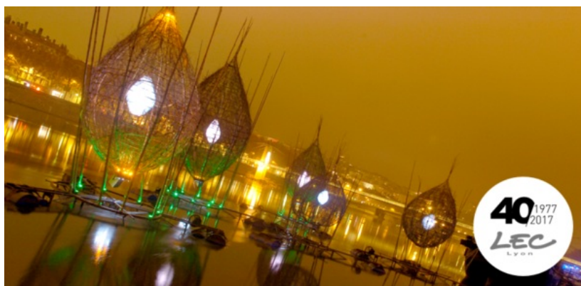
Lyon's Festival of Lights in 2004, a first trial of using LEDs in a festive setting.

For Lyon's Festival of Lights in 2004, I was lucky enough to be given the chance to create a 100%-original LED installation as part of the experimental development of the banks of the river Rhône , initiated by Roger Narboni, the event's artistic director at the time.