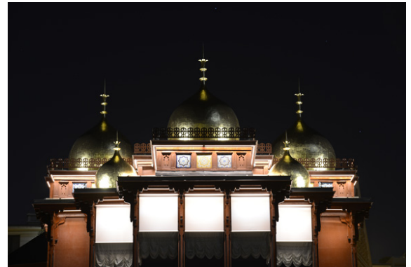
4020-Luminy 2 sans optique en blanc chaud.