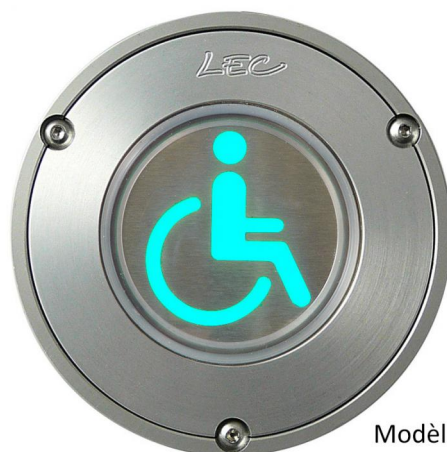
Modèle déposé (Europe)

Withstands occasional traffic from all kinds of vehicles